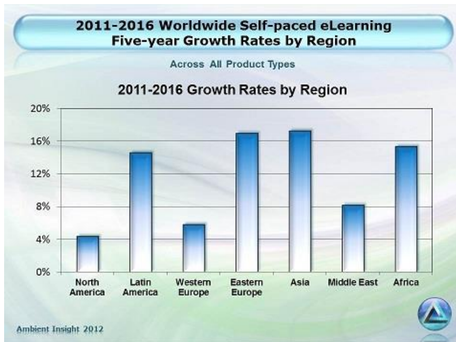
Figure 1. Growth rates for 2011-2016 global macro-regions

The European Union in 2011, was the second largest market for e-learning, has a growth rate of 5.8% per annum, which leads from 6.1 billion dollars in 2011 to the expected 8.1 billion dollars of 2016. There are approximately 3 million students enrolled in online courses, half of whom were enrolled in Distance Teaching University and Open University, while the other half at traditional universities that offer distance learning courses.